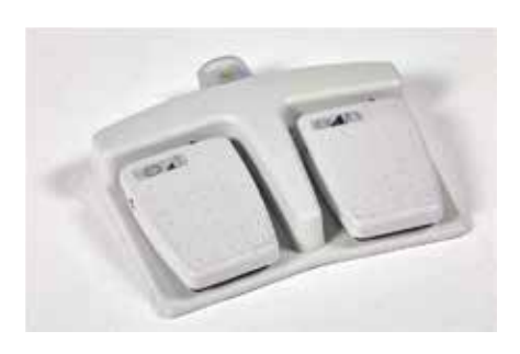
Wireless foot switch control* for improved cable management.