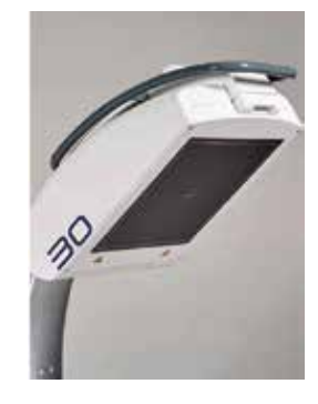
Zero dose centering with laser localizers on X-ray tube and flat panel detector.