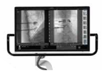
Top quality display, certified for medical use and in conformity with the relevant standards for diagnostic imaging.