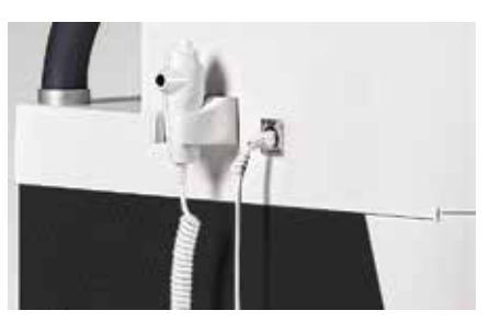
X-ray emission controlled by either a foot switch or a multi-function hand switch.