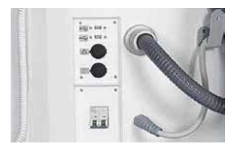
Wide range of connectivity and output options including USB, Ethernet, HDMI and WiFi.