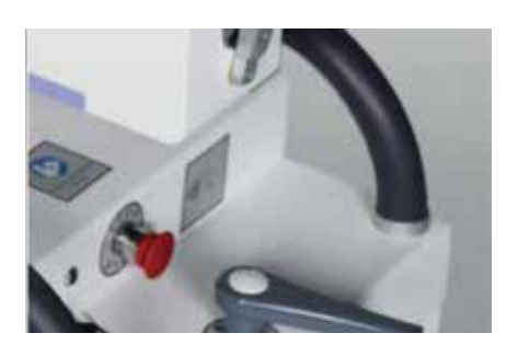
Instant login with Smartcard NFC device.*